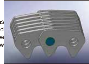
圆销式静音链 Round pin type silent chains

Round pin type silent chain is mainly used for transfer case and gearbox as system, which is the core component of the drive system. The chain is made superior quality steel and the plates of which are austempered, which is especially suitable for various conditions such as high strength, high wear resistance, low noise and big torque etc..